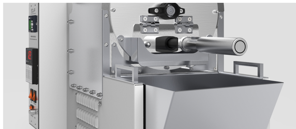
Large pyrex lens for easy moanitoring