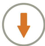
Low Energy Consumption