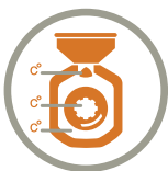
Multi Point Temp.