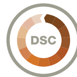
Drum Speed Control