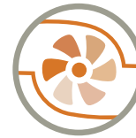
Blower Speed Control