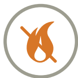
In Drum Extinguish